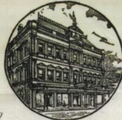
I.O.O.F. TEMPLE, SYDNEY.

15 th / 9 th / 19 th / 15 To The Hon Minister for Defence Melbourne